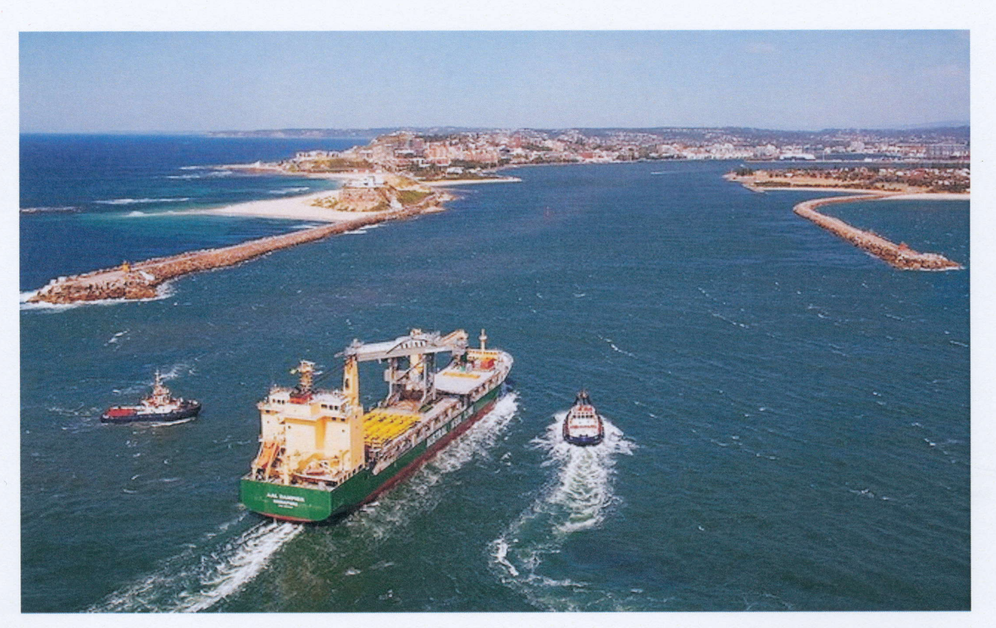
The AAL Dampier 18,707DWT approaches Nobby's while arriving in Newcastle, NSW on 15 October last year, carrying a Shiploader. The Australasia Line fleet currently consists of 16 vessels of various configurations.